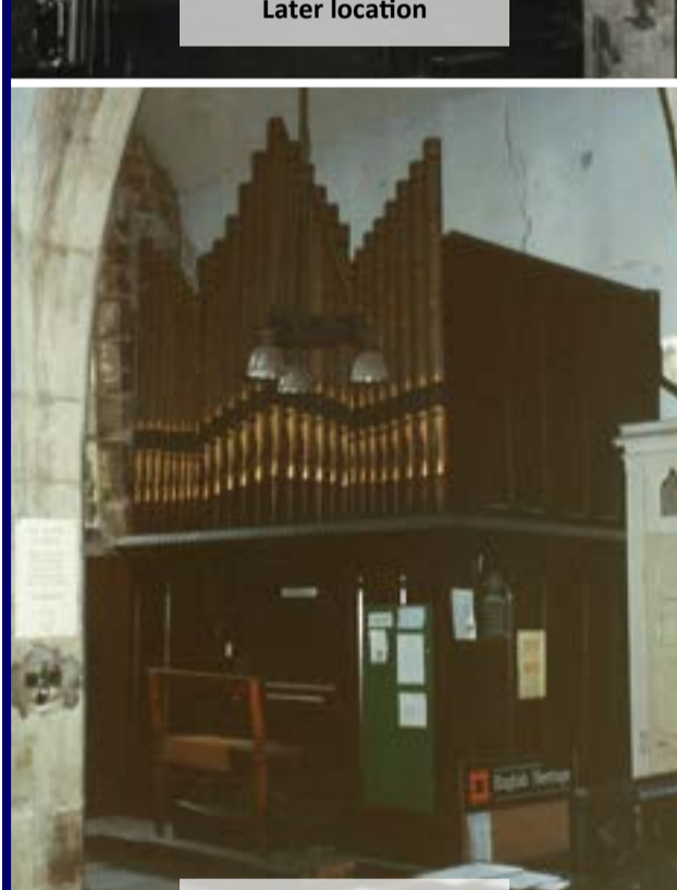
Shortly before removal