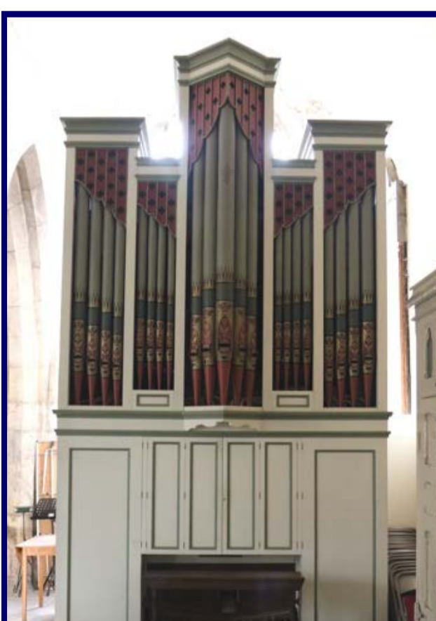
1996 organ case