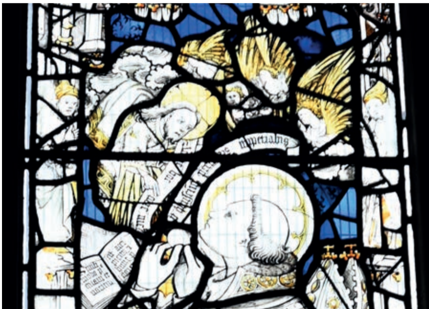
The archbishops head

Some of the imagery and text used in this window are unique. Fragmentary pieces from other lost windows were added here in the 1970s.