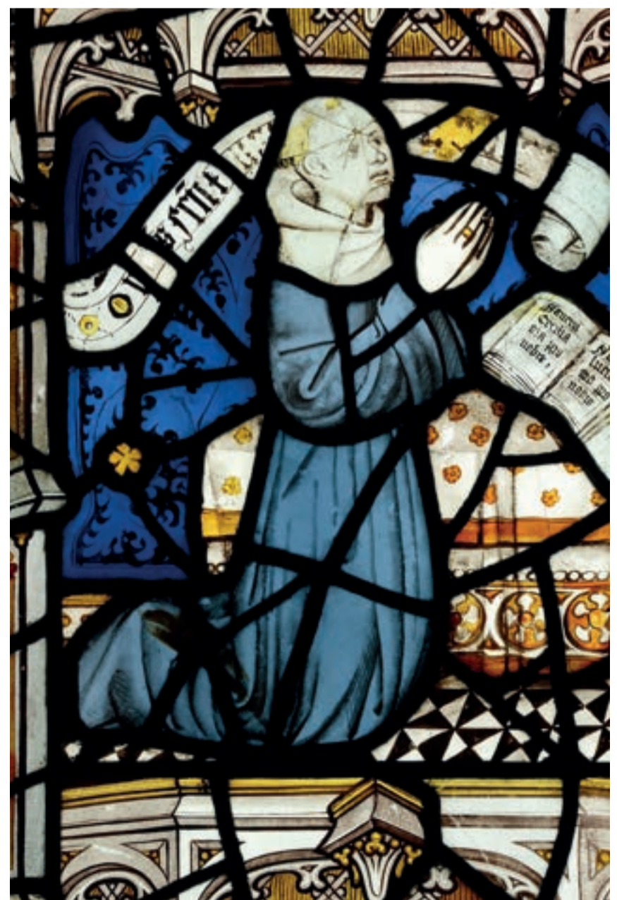
Close up of the beggar