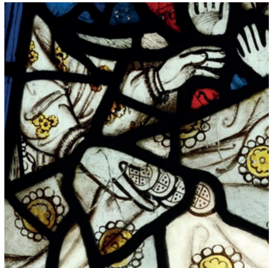
Detail of the coins on the bed in above panel

The beggar is disabled. He wears leather knee pads and has three-legged stools for his hands to help him crawl.