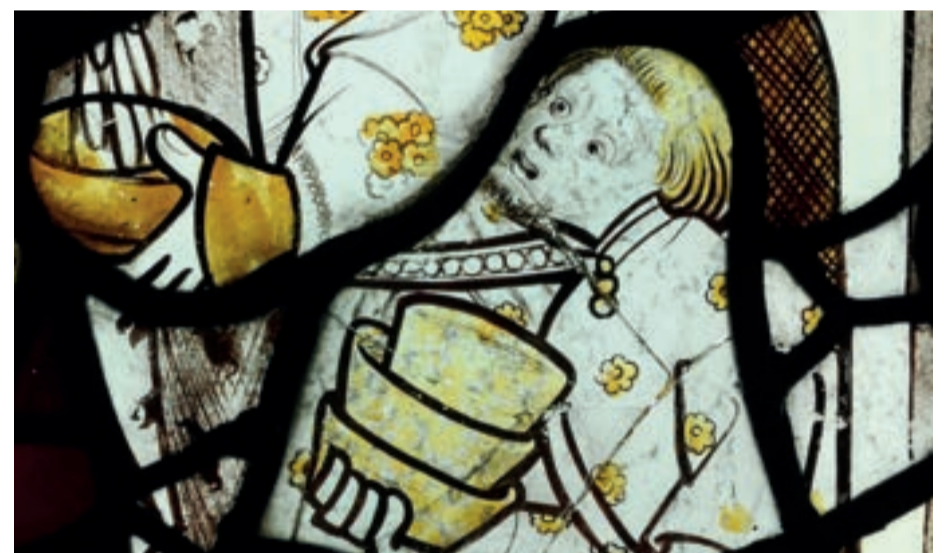
Details of the patterns in the clothing