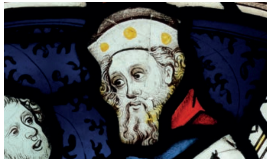
Close up of the good man's face