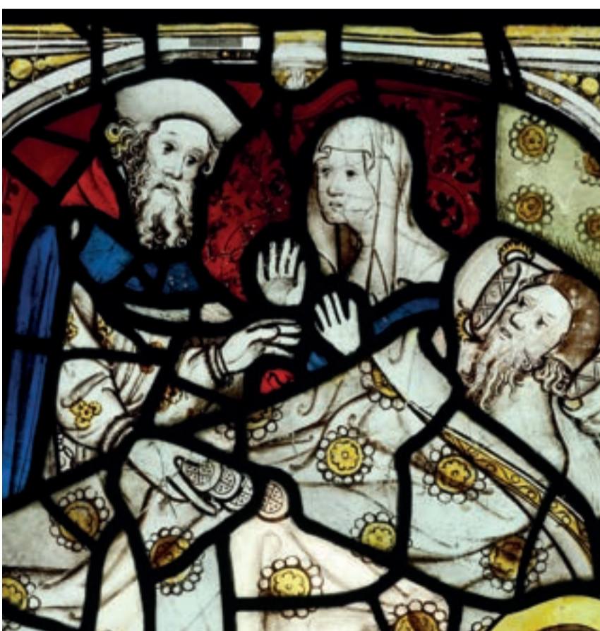
The visiting the sick panel