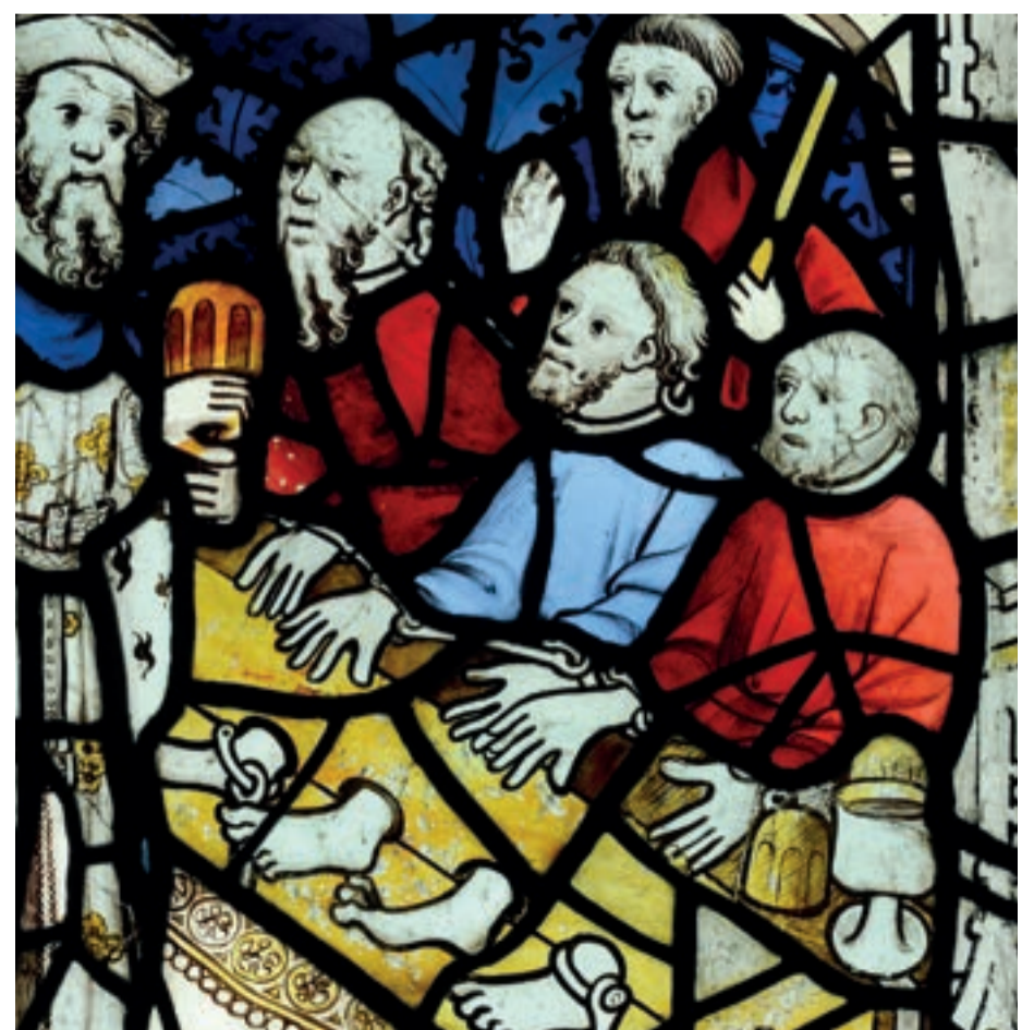
Close up of the prisoners in stocks