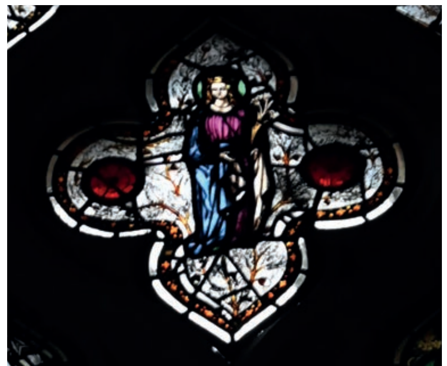
Close up of Our Lady in tracery lights

We think the tracery lights, which are the small pieces of glass at the top of the window, have always been here. They wouldn't have fitted above the High Altar. They show St George (left) and St Michael (top) both killing dragons. Our Lady is on the right. She was probably originally shown treading a serpent or dragon under her feet.