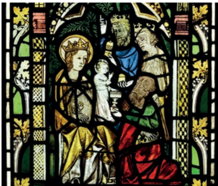
Close up from the Great East window